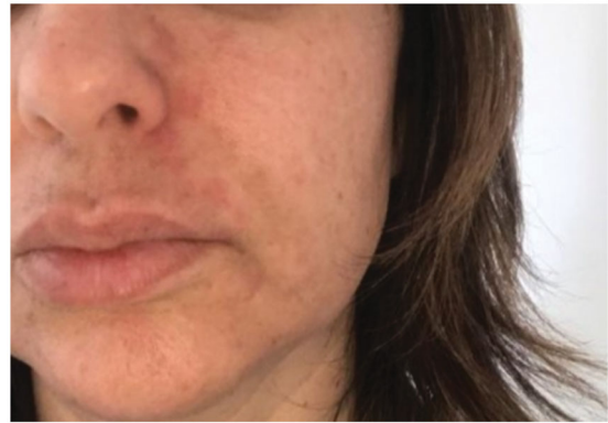
Figure 4. 6 October 2018. Result after the 7th session in hyperbaric chamber. Patient was discharged from treatment because full reperfusion of the affected area had been achieved.

medical evaluation, filling with PMMA was indicated to fill the region. After the consent form was signed by the patient, the procedure was performed. Local anesthesia with lidocaine 2% was administered in the mental region, and a 22 G microcannula was inserted through the entry point to inject PMMA 10%. The correction of a depression caused by a prosthesis on the left side of the chin started, however, when 0.3 mL of