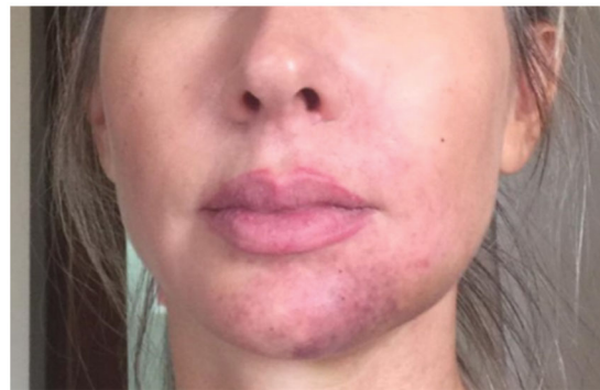
Figure 8. 13 January 2019. Result after the 3rd session in the hyperbaric chamber.