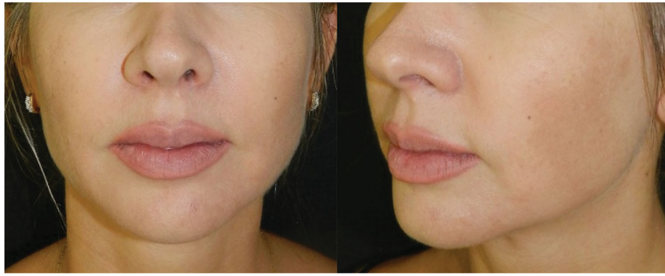
Figure 10. Follow-up one month after the procedure.

(100%) to provide an ideal setting for wound healing [8]. Based on scientific works and clinical data of more than 10 years, this study analyzed the use of oxygen therapy in a hyperbaric chamber to treat vascular occlusions resulting from filler procedures.